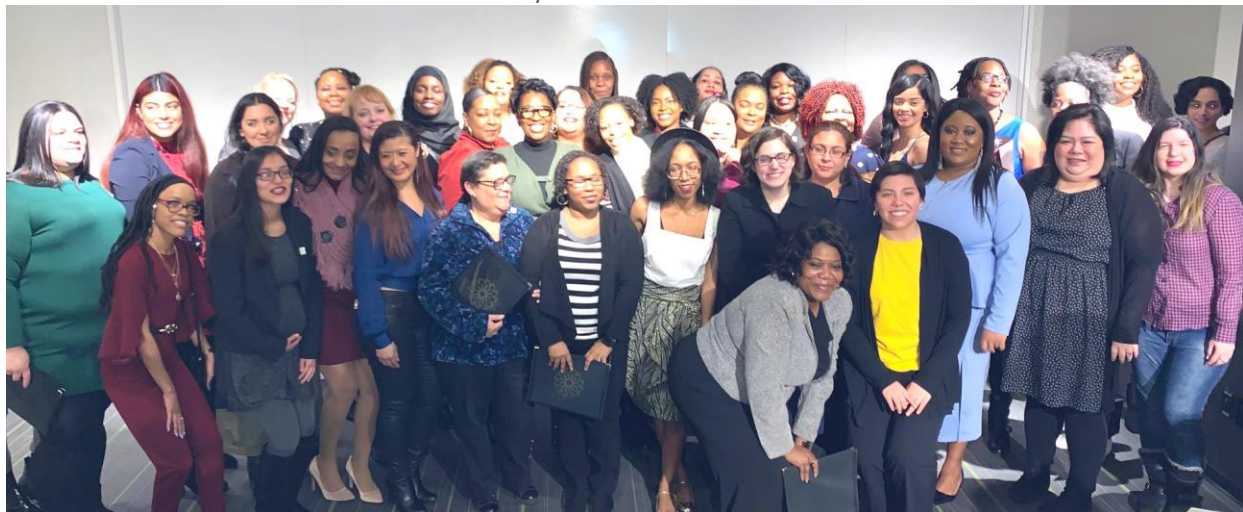
2019 December Graduating Class