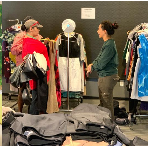
Dress with Grace